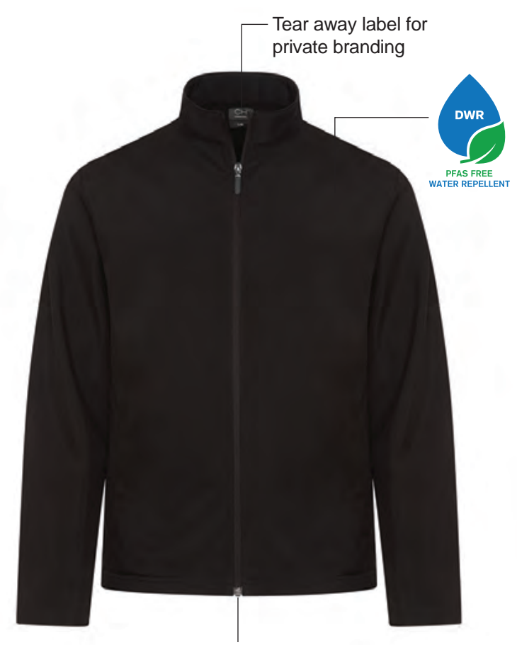
Reverse coil zipper at centre front and hand pockets