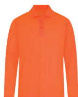
SAFETY ORANGE No PMS