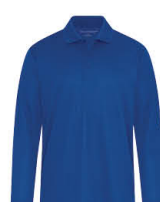
TRUE ROYAL 7686C