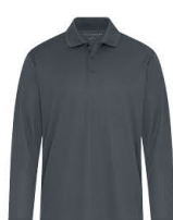
IRON GREY 7540C