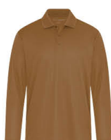
DUCK BROWN 7574C

Due to the nature of polyester, special care must be taken throughout the decoration process.