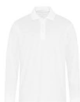
WHITE No PMS