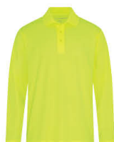
SAFETY YELLOW No PMS