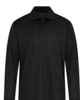
BLACK Black 6C

Textile fabric colours are subject to dye lot variation and will not be exact match to print pantone reference