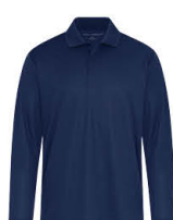
TRUE NAVY 539C