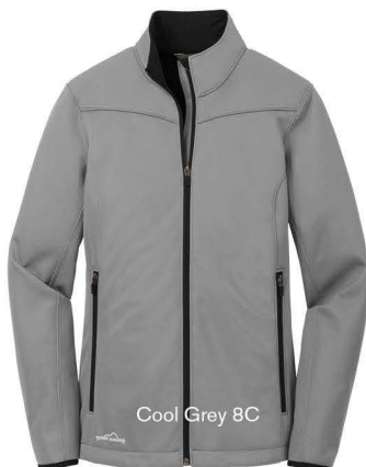
Cool Grey 8C