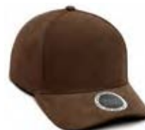
CHOCOLATE BROWN 7589C