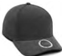
DARK GREY 426C