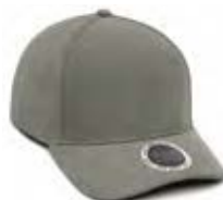
LIGHT GREY 7538C