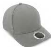
DARK GREY Cool Grey 9C