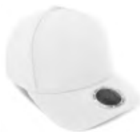
WHITE No PMS