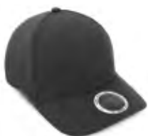
BLACK Black 6C

Textile fabric colours are subject to dye lot variation and will not be exact match to print pantone reference