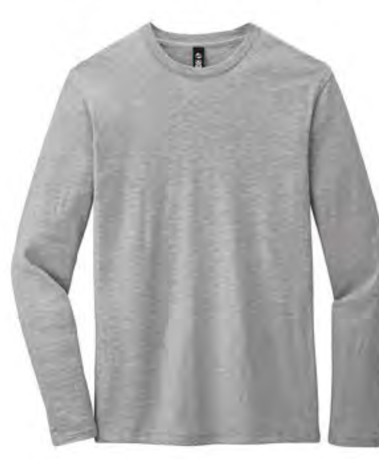
COOL GREY 5C