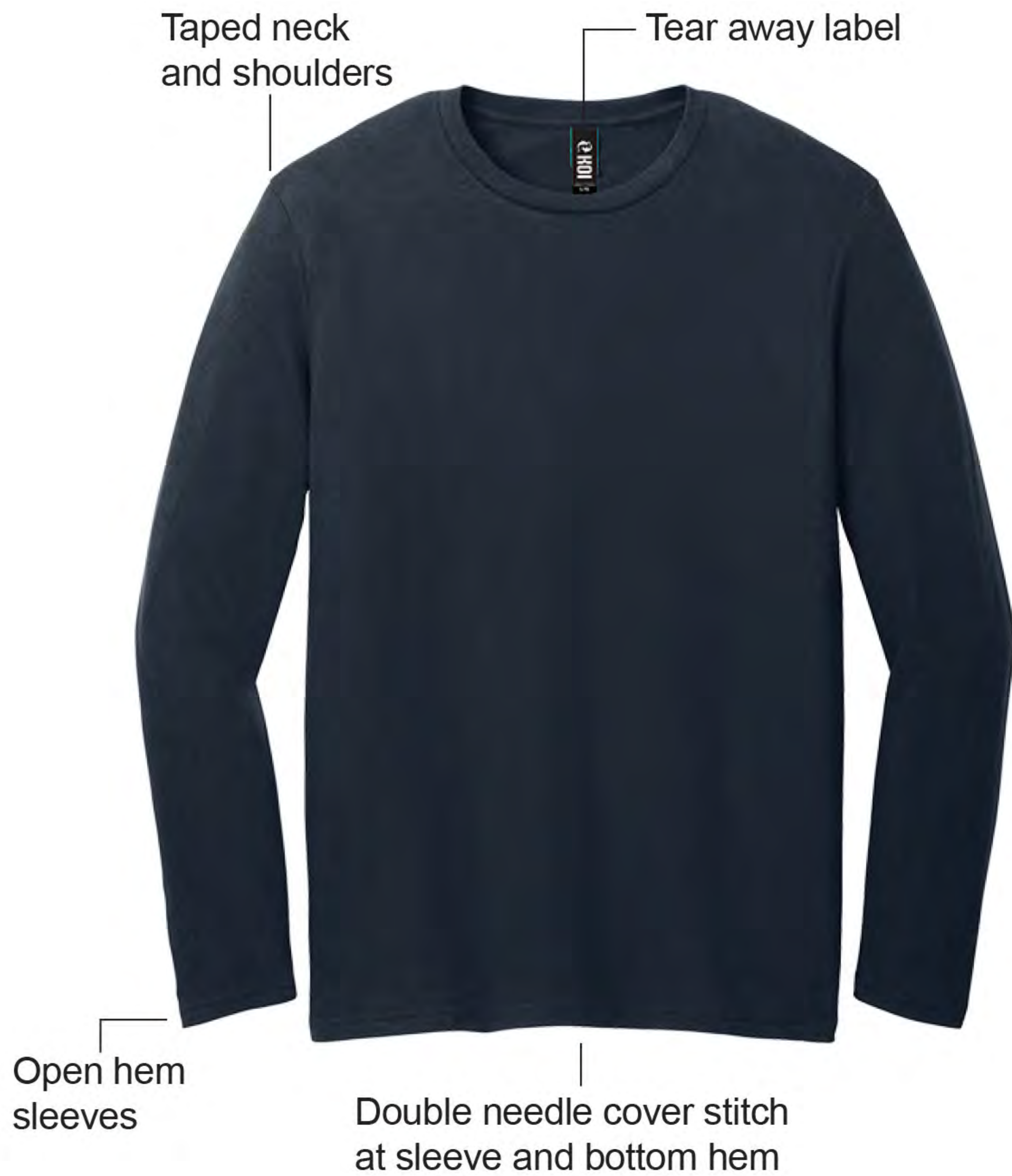
1x1 rib knit collar