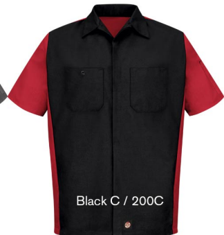
BLACK / RED