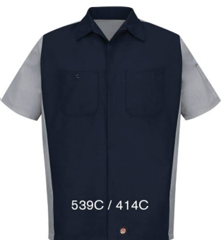
NAVY / GREY