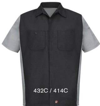
CHARCOAL / GREY

Textile fabric colours are subject to dye lot variation and will not be exact match to print pantone reference