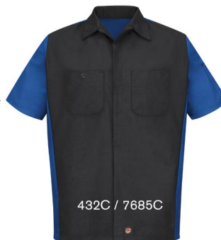
CHARCOAL / ROYAL BLUE