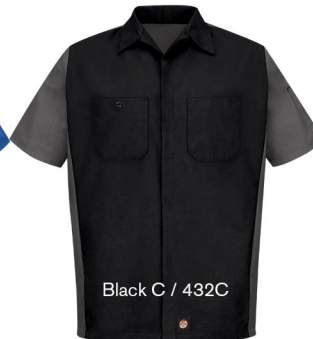
BLACK / CHARCOAL